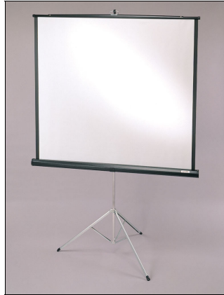
T50, T60, T70 & T80